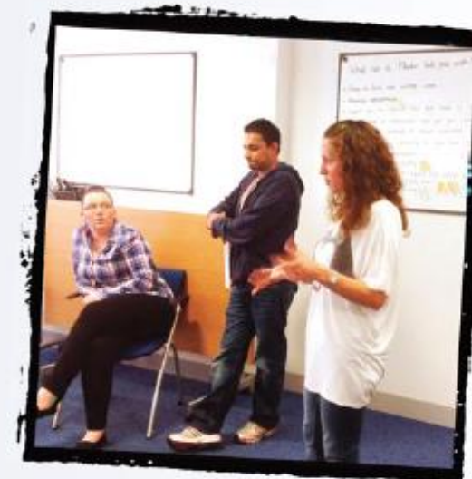
Promoting the scheme at West Essex DU

The opportunity to mentor or be mentored will be discussed with all service users managed by Essex Probation, beginning at induction and continuing throughout their Supervision.