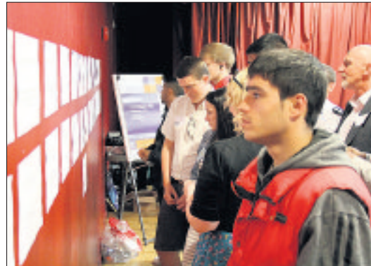
Information on the launch of the youth advisory group

Other suggestions included greater respect from police during stop and searches, and basing case workers around the